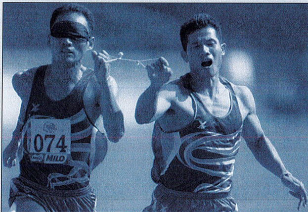
A blind runner and his guide approach the finish line during a paralympic event in Malaysia.

Study the image and caption below. Think about the message being conveyed.